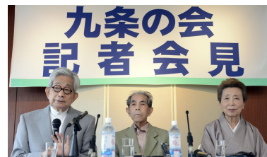
The Founding of Article 9 Association (2004)

government accountable to them. Organizations such as "Save Constitutional Democracy" represent this updated brand of pacifism that seeks a broader constituency to hold off further challenges to Article 9 by the nationalists in government. 21 In this perspective, constitutional pacifism embraced by popular, democratic choice constitutes the ultimate moral recovery from the long defeat. 22