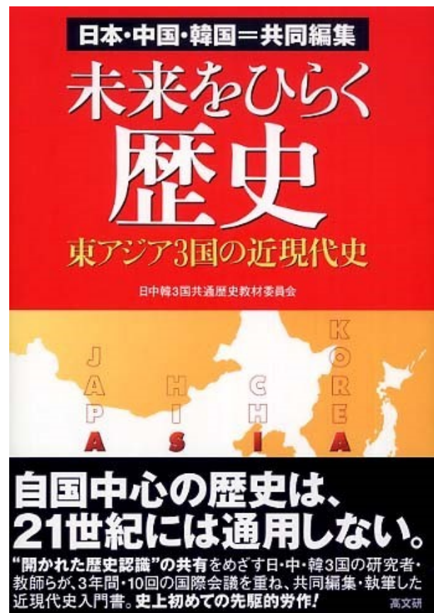
History That Opens the Future (2005)

understanding of the most pressing issue facing the three nations, the territorial disputes. Yet it is this type of painstaking and persistent work of cultivating civilian dialogue, however difficult it may be, that ultimately paves the way for future generations to pursue the task of East Asia’s reconciliation. These efforts join the assiduous work of many activist-scholars like Utsumi Aiko, Ōnuma Yasuaki, and others who have labored to achieve transitional justice and redress in Asia over the decades. 34